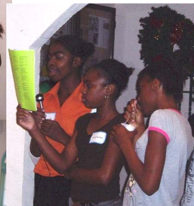
Wrapping holiday gifts for family members, eating together and youth caregivers singing at the Celebration.