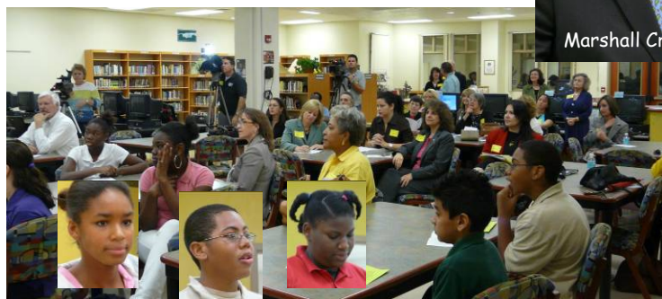
The Caregiving Youth in the audience