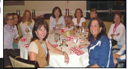
Fun with Friends