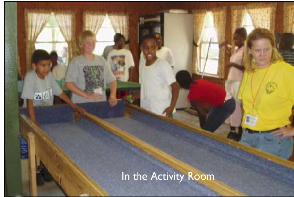
In the Activity Room

The VHFC Caregiving Youth Project held its first overnight camp April 27 th to 28 th at Gold Coast Christian Camp in Lake Worth Florida. Fourteen caregiving youth representing Boca and Congress Middle Schools, had a great time and bonded with their common thread of caring!