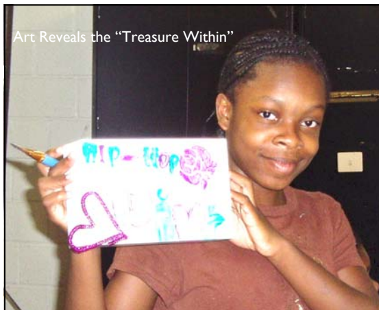
Art Reveals the "Treasure Within"

say, "Can I just stay here?" tells it all. CYP is making a difference in the lives of these young caregivers.