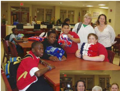
CYP and Project Linus