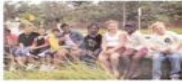
Youth Caregivers at Seaside House

"The program has given me courage and lets me know I am not alone."